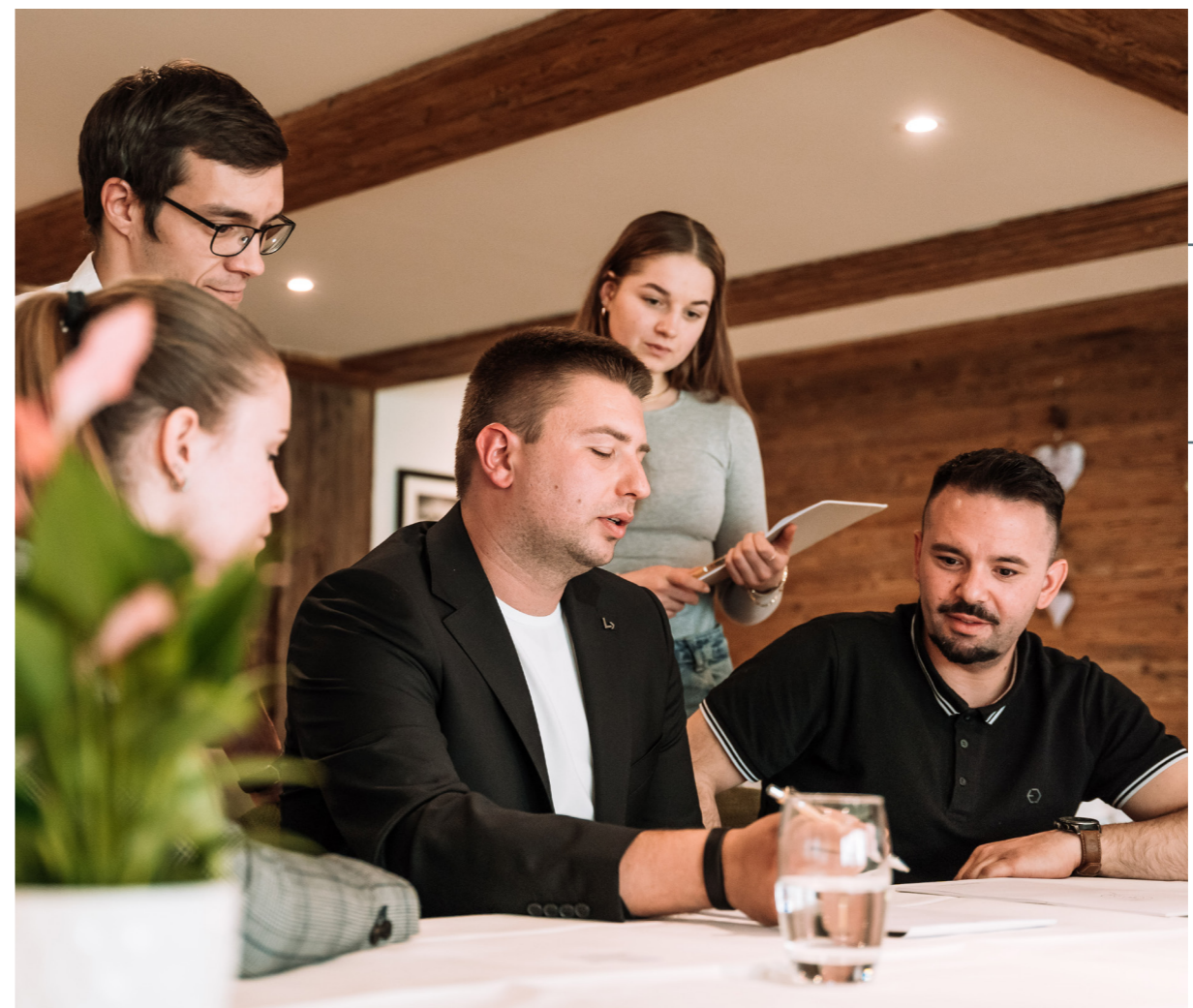
Meeting Room 112 m 2 50 - 60 people