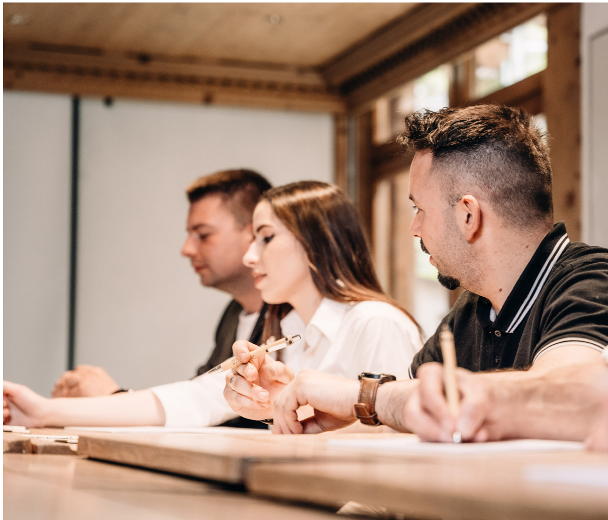
Classroom 35 m 2 21 - 40 people