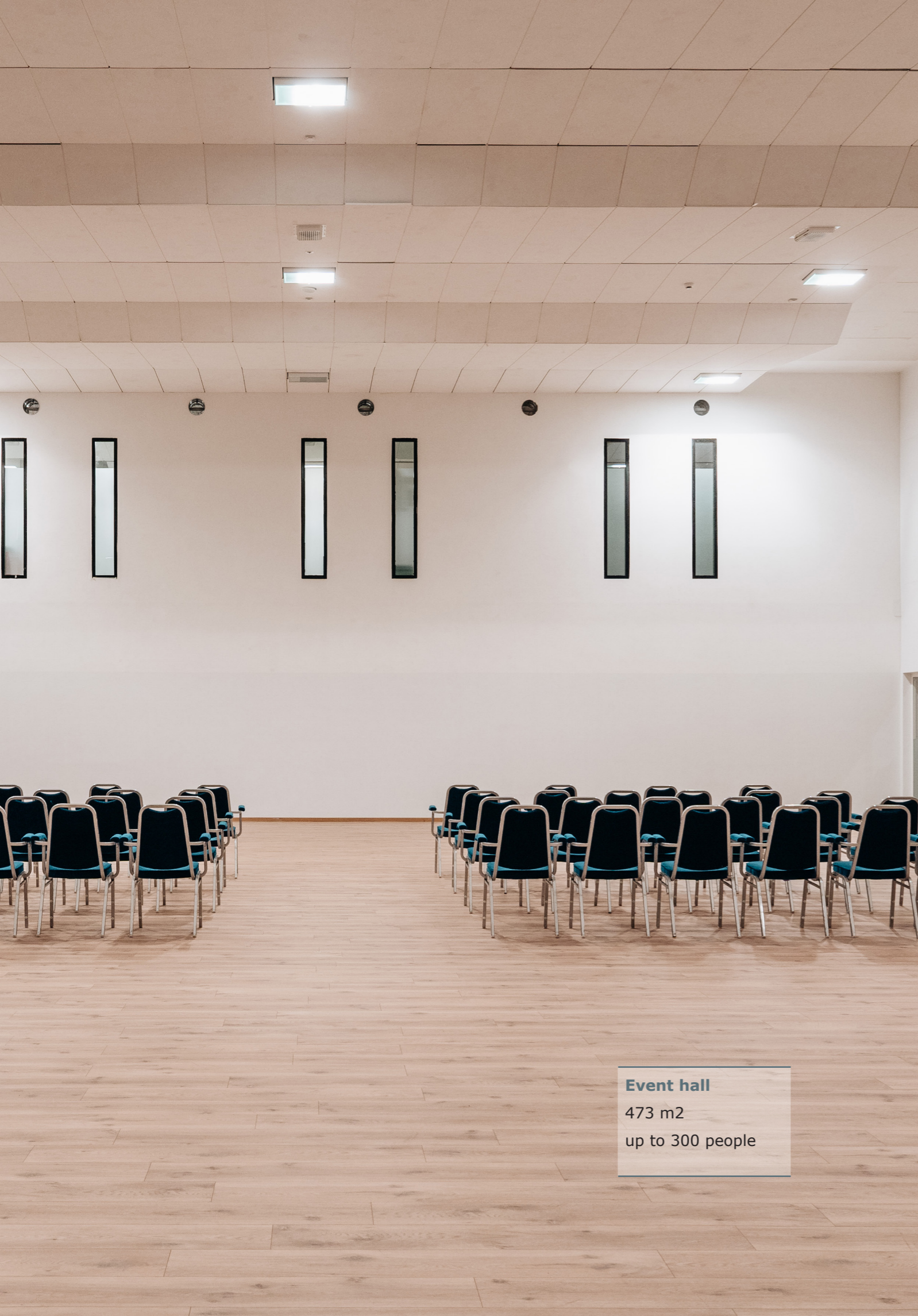
Event hall 473 m2 up to 300 people